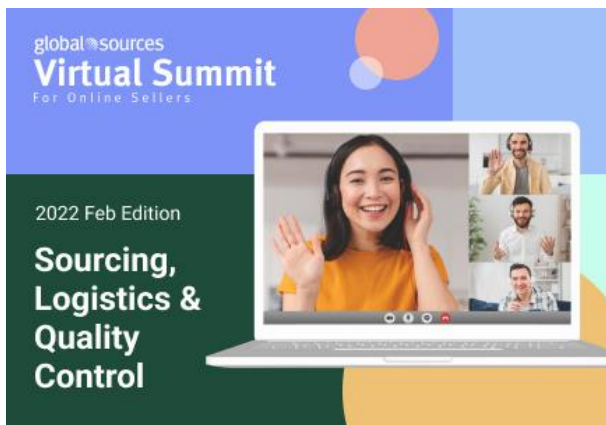
Virtual Summit World-remowned e-commerce conferences