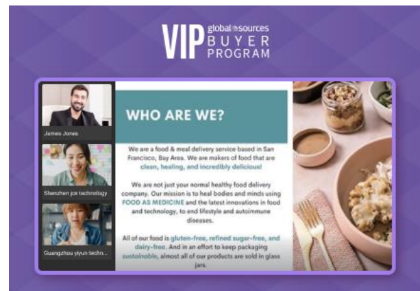
Meet Your Supplier LIVE Matchin suppliers with quality buyers worldwide