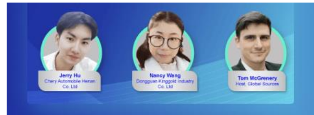
Mexpo Source LIVE Interactive digital sourcing experience